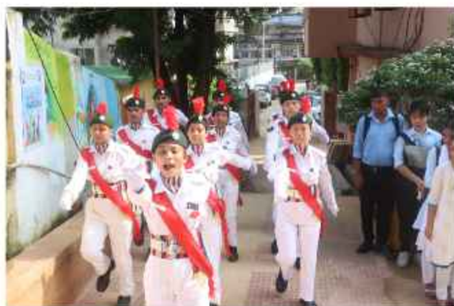
Celebration of 77th Independence Day