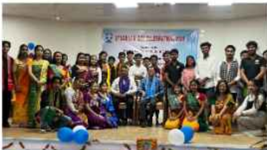
Freshmen Social organised by Dispur College Bodo Literary Society

Separate forms will be issued online for H.S. (Arts and Commerce) and B.A., B. Com., BBA, BCA.