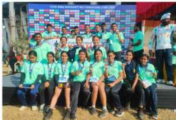
Participating in the Coal India Limited Half Marathon conducted by the Indian Army

Each student need to complete two courses of 4-credits each – one from English Usage and other from the group of MIL, especially designed for this purpose. These courses have to be taken during Semesters 1-2.