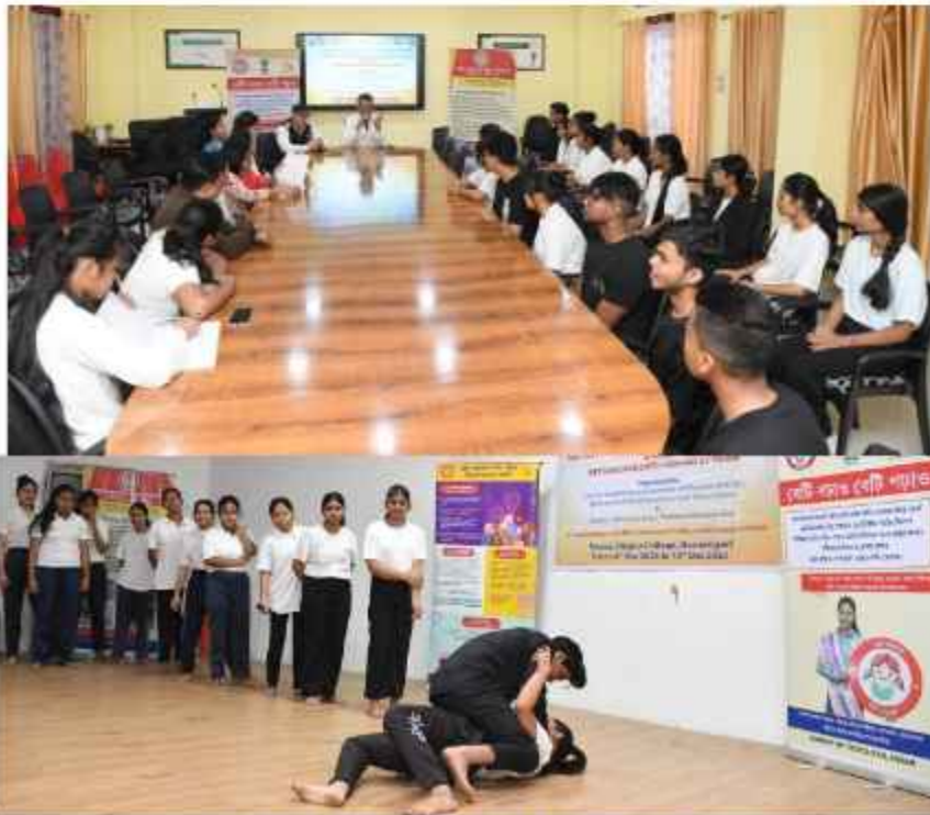
Self-defense training for women