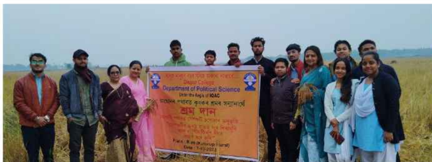
Experiential Learning/Community Service

The Digital India programme is a flagship programme of the Government of India with a vision to transform India into a digitally empowered society and knowledge economy. Dispur College has also adopted the same, and introduced Cashless Transaction, Leave Management System (LMS), Student Feedback System, Student Attendance, Office-Automation, Library-Automation (Web Opac, E-resource Centre, Government E- Market Place(GeM), PFMS, E-Admissions through Darpan and SAMARTH E-govt. portal.