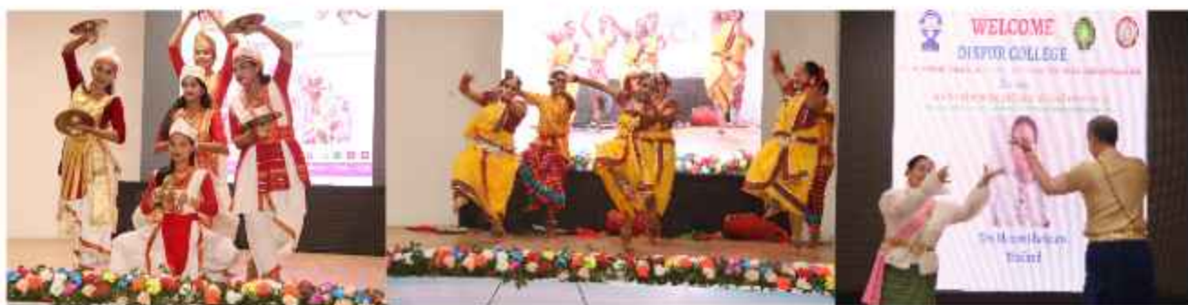
South East Asian Cultural Conclave