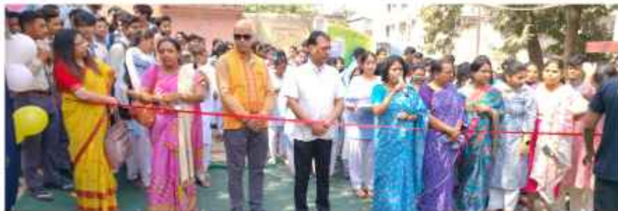
Celebration of International Women's Day