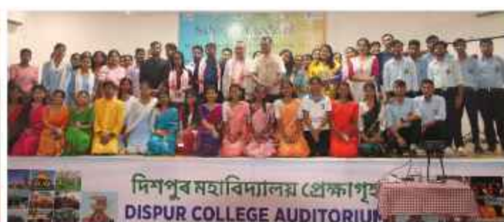
Sahitya Akademi sponsored Seminar organised In the college