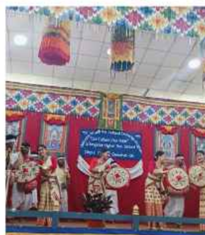
International Cultural Exchange Programme in Bhutan