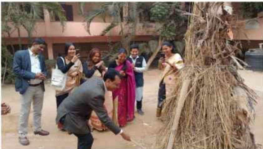
Celebration of Magh Bihu