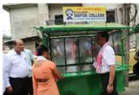
Distribution of four Wheeler "Employment on Wheel"