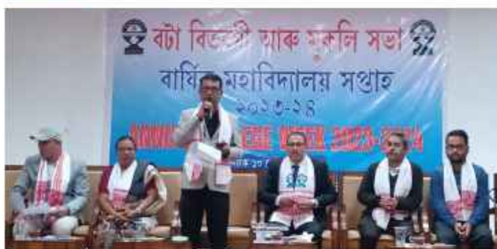
Prize distribution Ceremony of the College