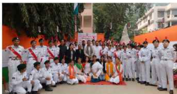
75th Republic Day Celebration