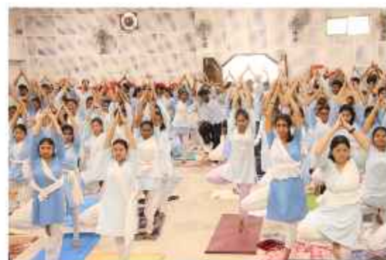
Observation of International Yoga Day