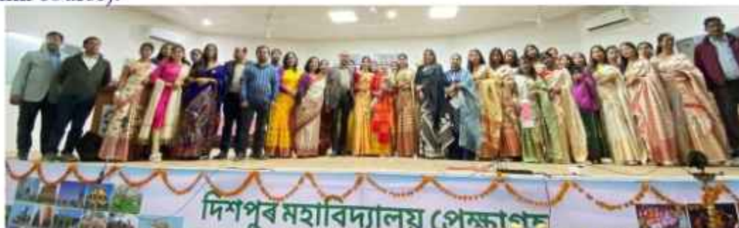
Faculty members and students on the occasion of college week prize distribution ceremony.

One can exit the programme after two-year course as well. In this case, the student will have to complete one extra Vocational / Skill course of 4 credits and can exit the programme. The student will get a Diploma. The minimum total credit requirements are 84 (and 4 credits extra for the exit Vocational / Skill course).