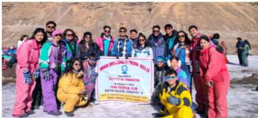
Excursion to Manali under YUVA Tourism Club