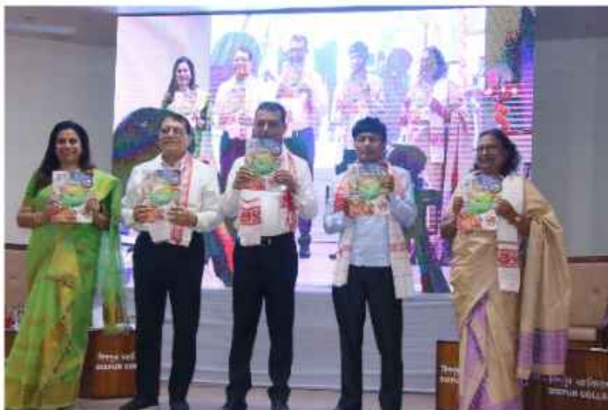
Release of “Dispurian” on 45th Foundation Day of college.