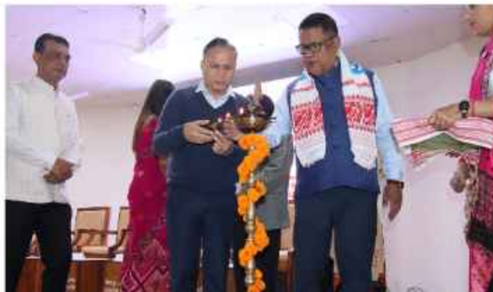
Hosting Teacher's empowerment programme on behalf of Dept. of Education, Govt. of Assam