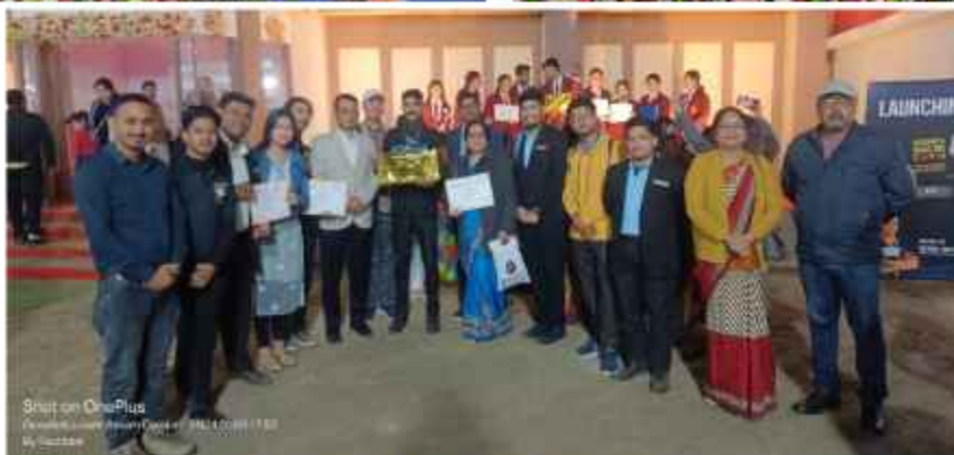
Participation in Assam Book Fair 2023