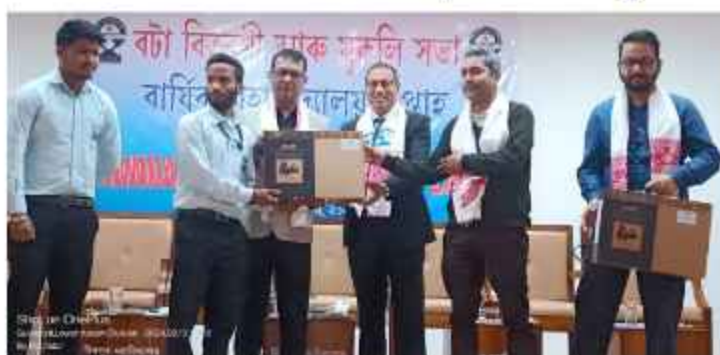
Distribution of Free Laptops to meritorious students