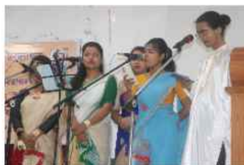
Celebration of Rabha Divas